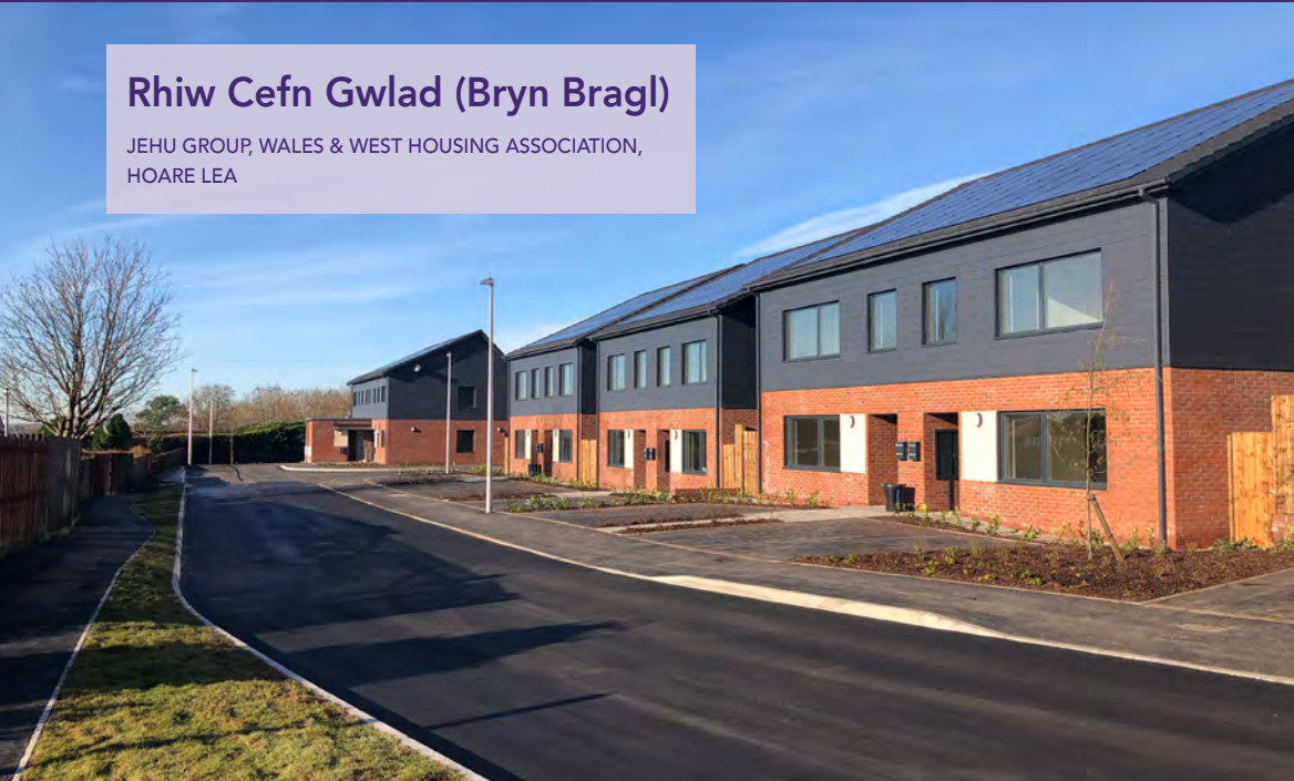
Rhiw Cefn Gwlad (Bryn Bragl) JEHU GROUP, WALES & WEST HOUSING ASSOCIATION, HOARE LEA