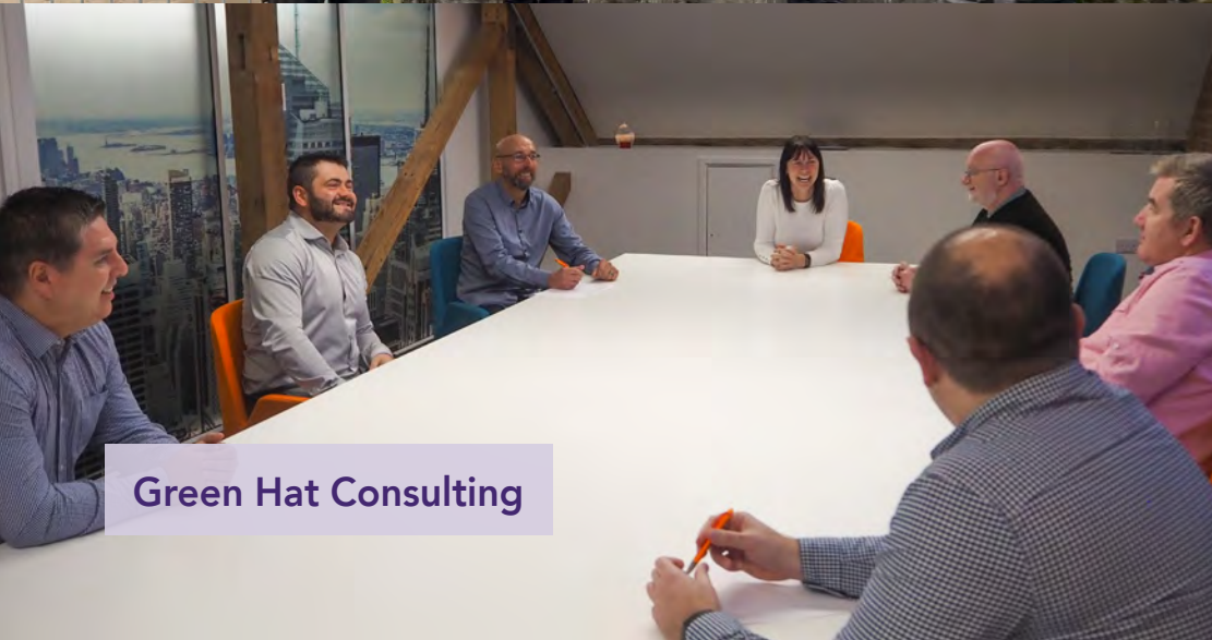
Green Hat Consulting