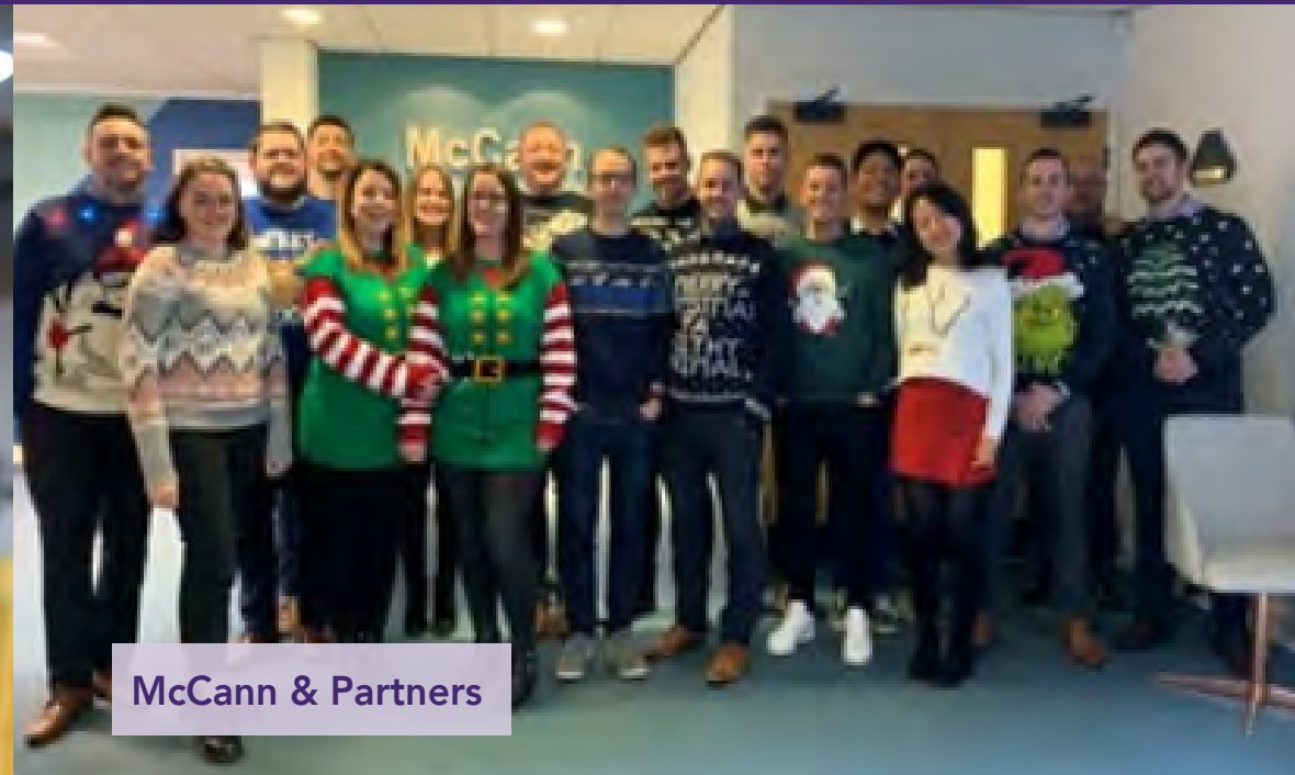
McCann & Partners