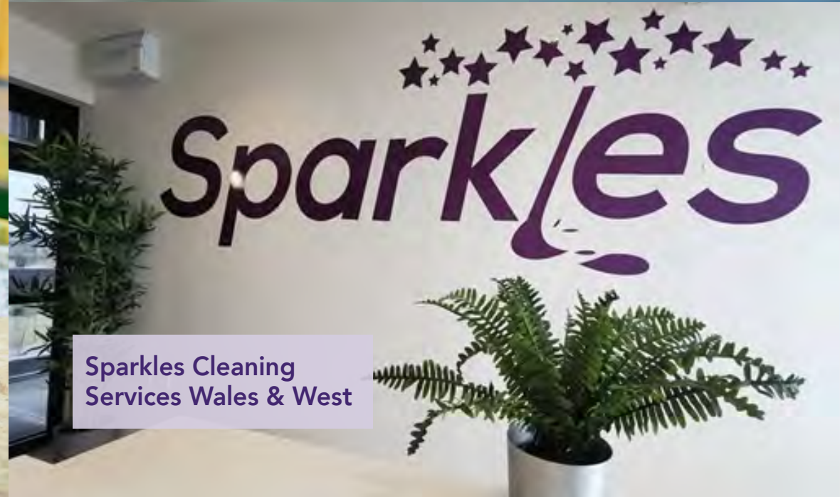
Sparkles Cleaning Services Wales & West