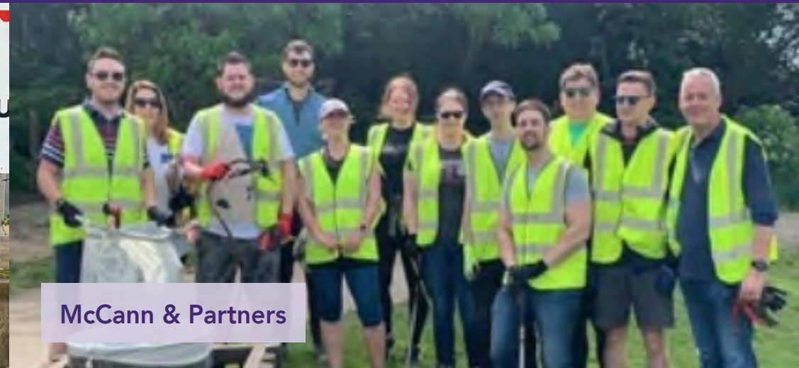
McCann & Partners