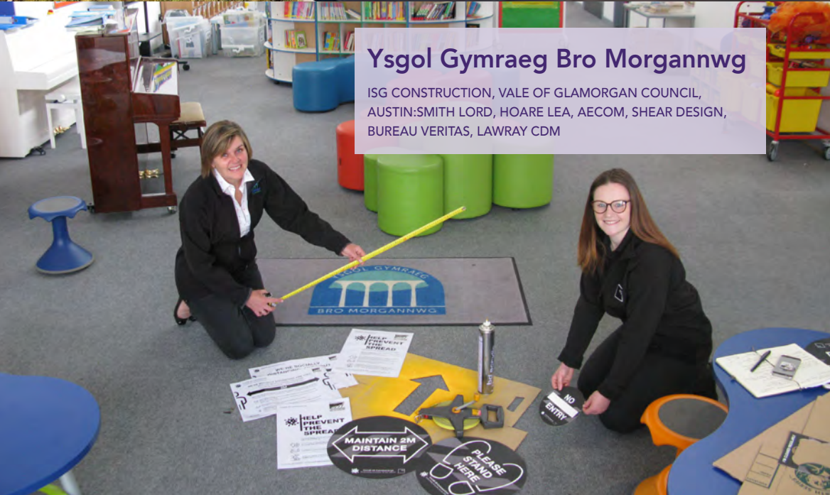
Ysgol Gymraeg Bro Morgannwg ISG CONSTRUCTION, VALE OF GLAMORGAN COUNCIL, AUSTIN:SMITH LORD, HOARE LEA, AECOM, SHEAR DESIGN, BUREAU VERITAS, LAWRAY CDM