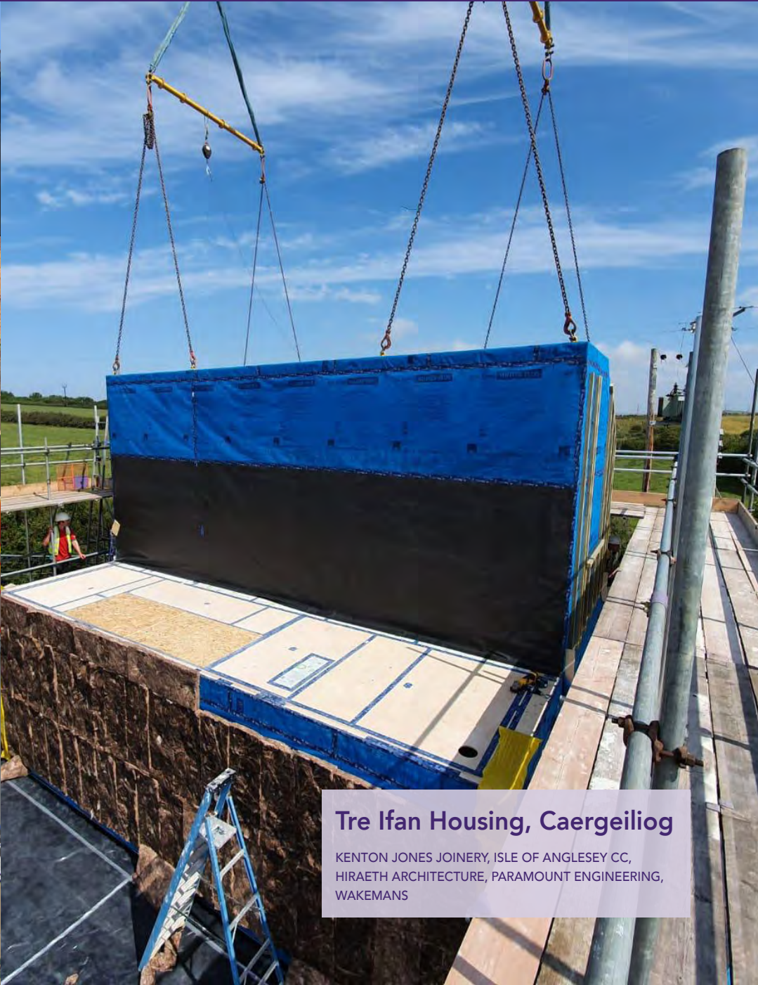
Tre Ifan Housing, Caergeiliog KENTON JONES JOINERY, ISLE OF ANGLESEY CC, HIRAETH ARCHITECTURE, PARAMOUNT ENGINEERING, WAKEMANS