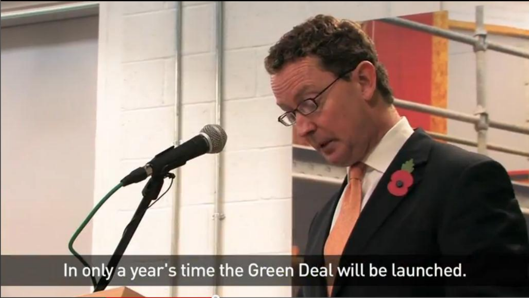
In only a year's time the Green Deal will be launched.