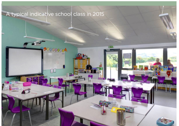
A typical indicative school class in 2015